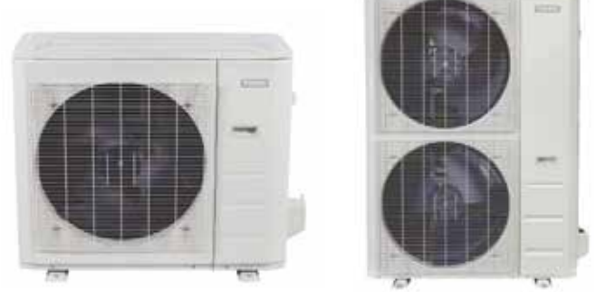
Outdoor Single- and Multi-Split Units